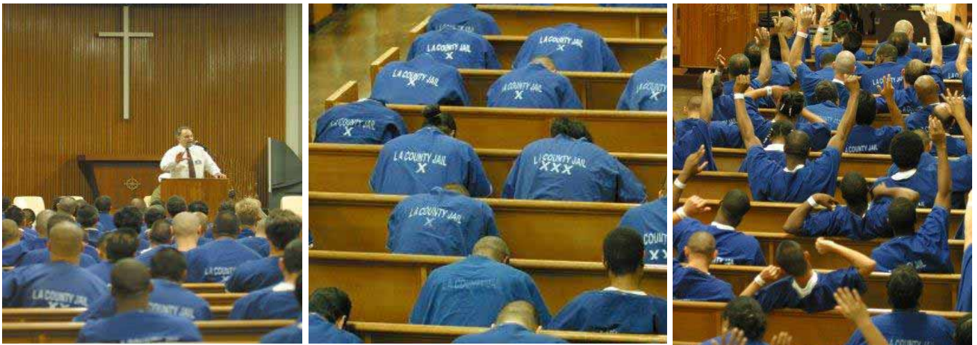
Giving the men a message of hope. At the end of the service they were told to bow their heads and if any of them wanted to be forgiven of their sins, to ask Jesus be their Savior, they were to raise their hands. The pictures speak for themselves as to what happened from then.

As part of the crusade we were able to go into the facility where I work. I have tried for years to get some pictures of what its like in there and our outreach enabled me to finally get some of them. This is the 3,000 floor Chapel, one of two chapels at Men's Central where we conduct services.